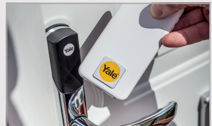
Phone Tag (Sold Separately)